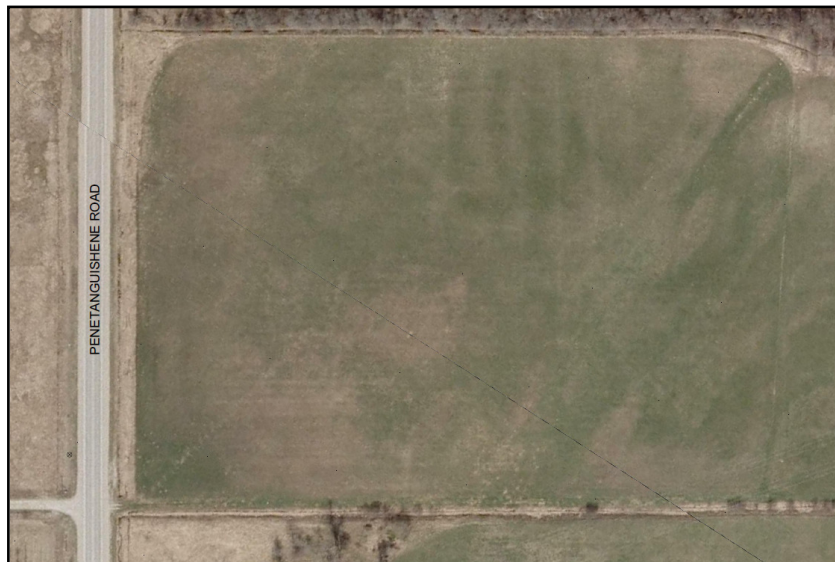
Figure 1. Aerial photo of the Project location.

The proposed solar power project is named Ground Mount Solar PV Power Project – L.P #15 (the Project). It is being initiated by Future Solar Developments Inc./Canadian Solar Developers Ltd, based in Scarborough, Ontario. The Project is located in the Municipality of Oro-Medonte, which is located approximately 30km north-east of the City of Barrie. The project address is L.P #15 Penetanguishene Road, Barrie, ON, L4M 4Y8. The Project area illustrated in Figure 1: