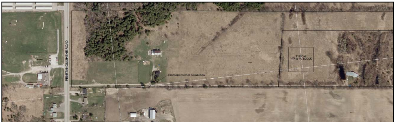
Figure 1. Aerial photo of the Project location.

Additional site photos are illustrated in Appendix 2 – Additional Site Photos.