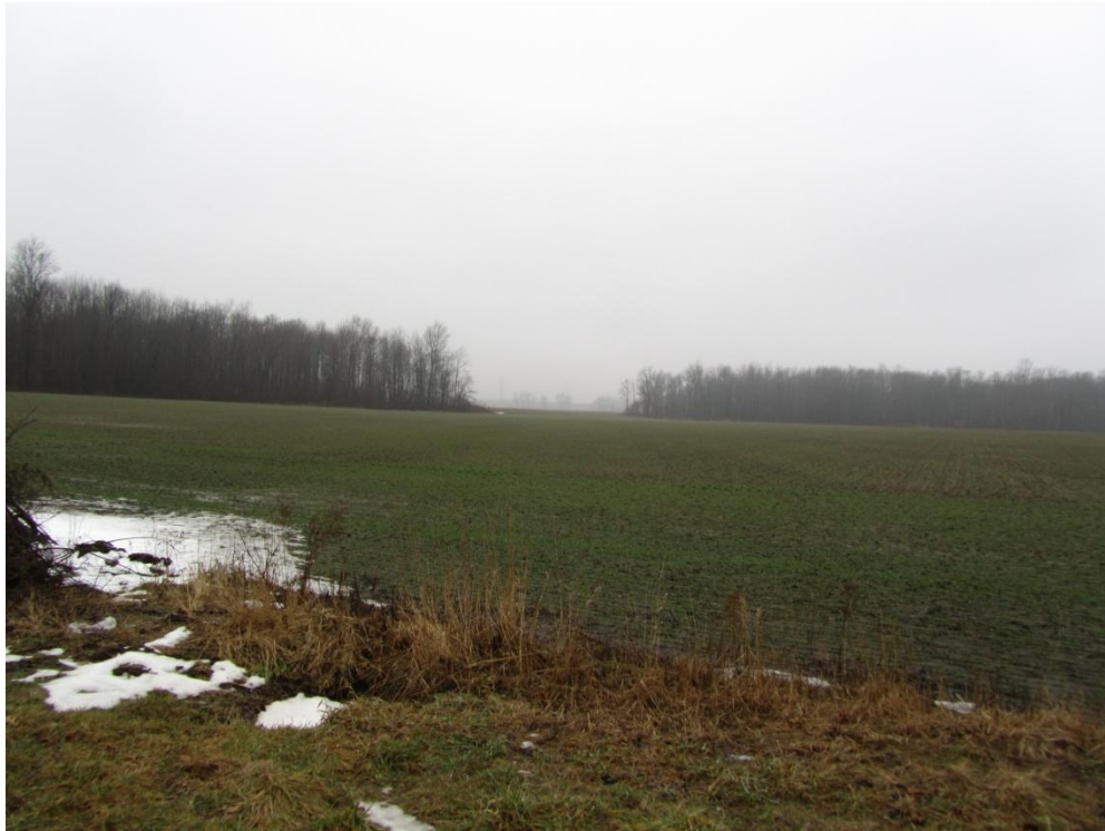
Photograph No. 1: Edge of the Site facing northwest; view of north and western woodlot