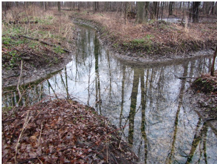
Photograph No. 6: Manmade drainage channels present in the northern woodlot; outside the subject property