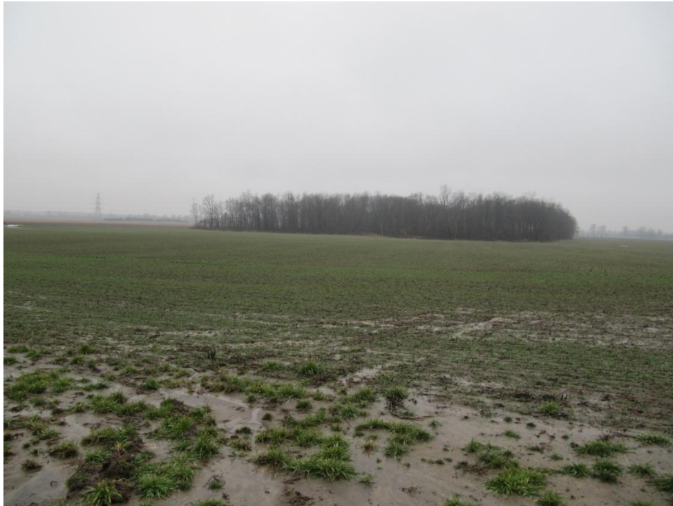
Photograph No. 5: Edge of proposed site, central on the property facing north; Northern woodlot present