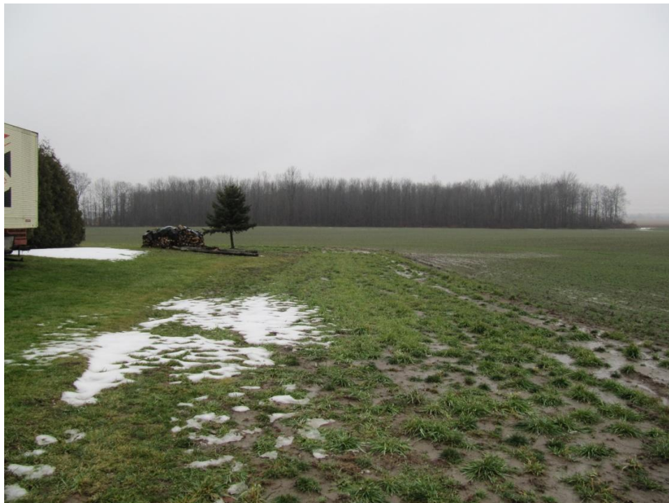
Photograph No. 4: Edge of proposed site, central on the property facing west; western woodlot present