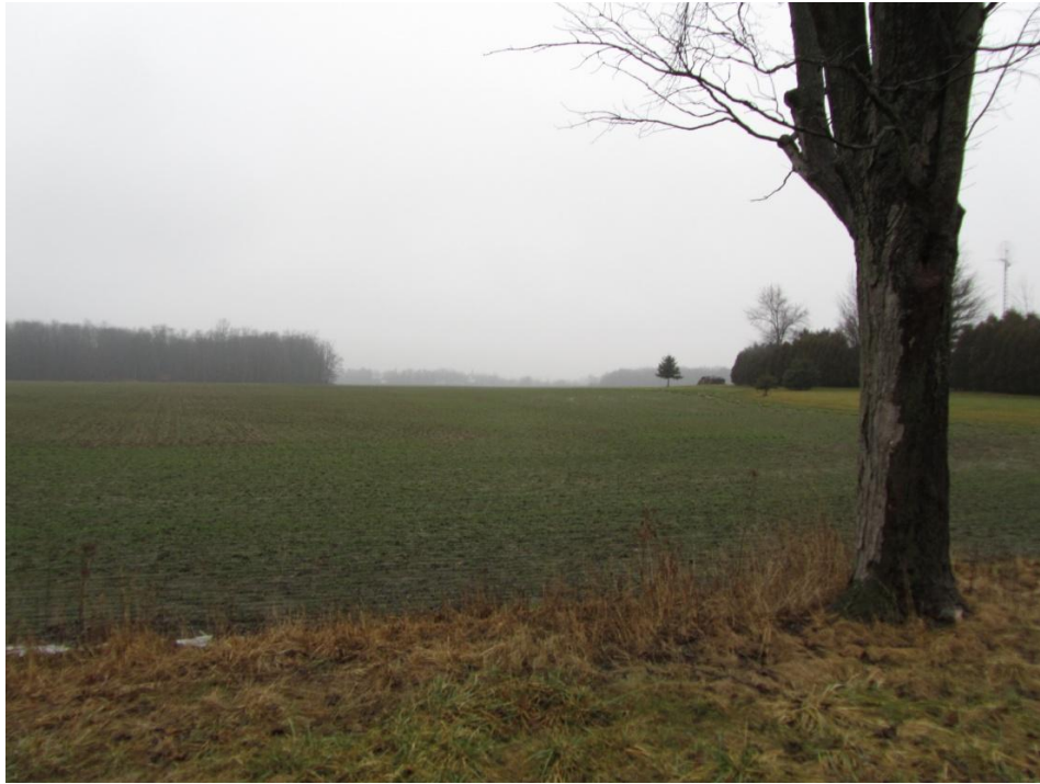
Photograph No. 3: Southern edge of property facing north; large sugar maples present along roadside