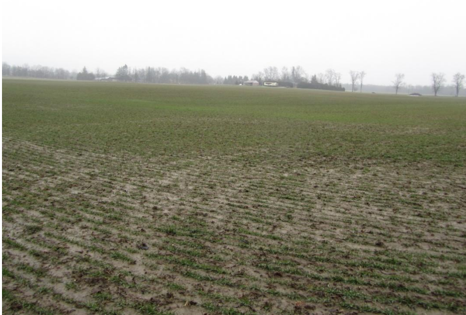
Photograph No. 2: North western corner of property facing south east; site consists of agricultural property